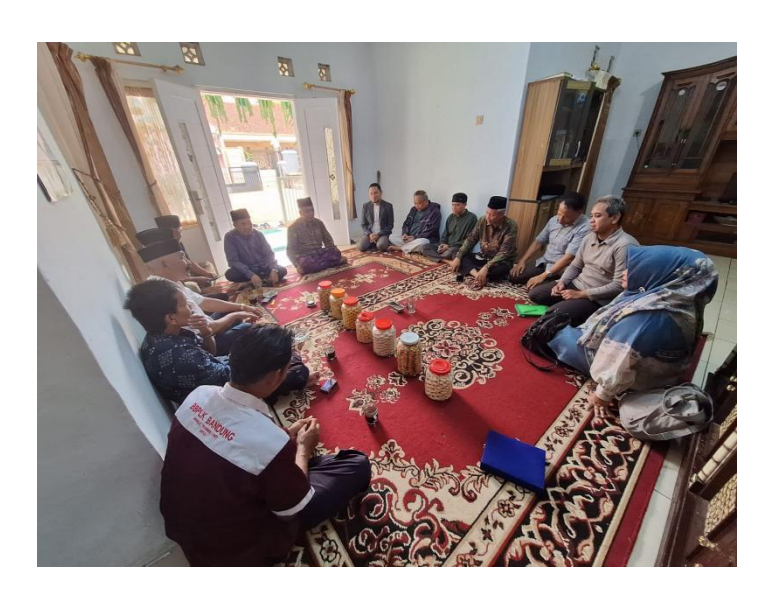
Figure 1: Socialization of PKM Activity Plans with environmental officials and the Head of Pondok Pesantren AT Taufiq Lembur Sawah

The results of the training seminar and the practice of making processed freshwater fish are as follows: