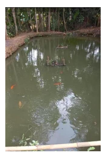
Figure 5: Pond owned by Mrs. Komalasari, one of the training participants Pond location Kp. Cilamo