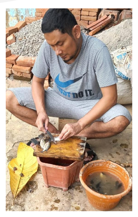
Figure 6: Processing of salted fish ingredients