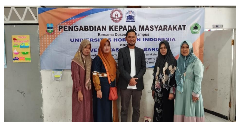
Figure 2: Training Seminar with residents of Kp Cilamo, in the hall of Pondok Pesantren AT Taufiq Lembur Sawah