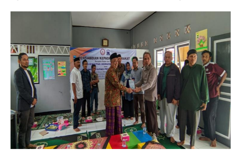
Figure 4: Handover of souvenirs from the Head of FMB Study Program at Horizon University of Indonesia to the Head of Pondok Pesantren At Taufiq Lembur Sawah